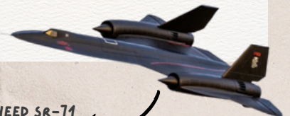
LOCKHEED SR-71 BLACKBIRD

Mary Ross played an instrumental role in the engineering and developing the P-38 Lightning and the SR-71 Blackbird.