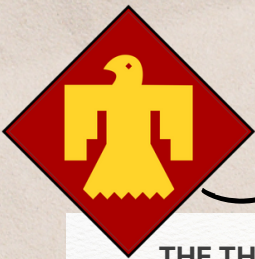
THE THUNDERBIRD INSIGNIA OF THE 45TH INFANTRY DIVISION